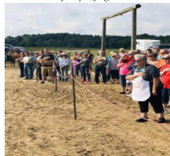
Some of the crowd during the National Anthem