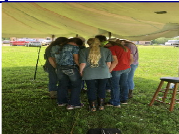
Youth Praying before service