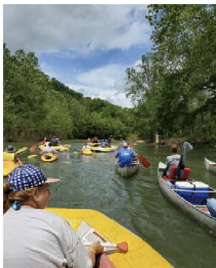
Float Trip Heartland 2020