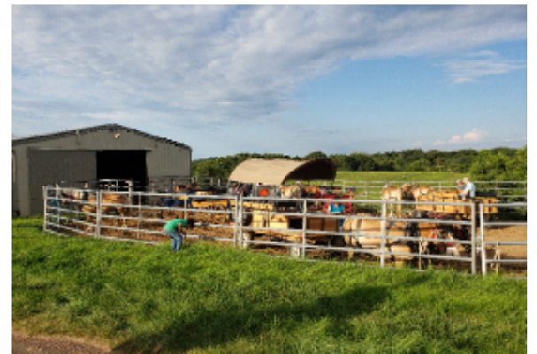
WAGON TRAIL PIT STOP