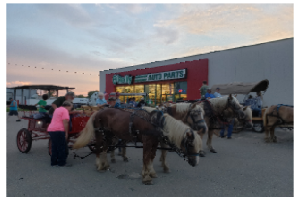
ICE CREAM WAGON TRAIN