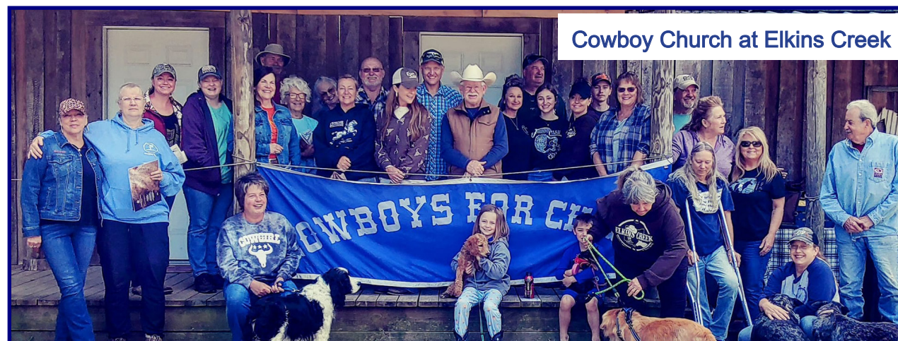
Cowboy Church at Elkins Creek