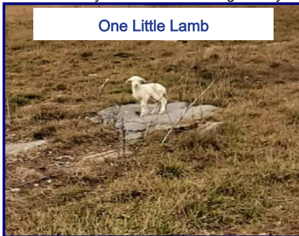
One Little Lamb

finds it truly, I tell you, he is happier about that one sheep than about the ninety-nine that did not wander off. In the same way your Father in Heaven is not willing that any of these little ones should perish." The other day the doctor called about my heart. There was something that concerns them. More tests. I thought of the loneliness that we feel when life doesn't go as planned. When our own mortality is in jeopardy. Like that little lamb, God comes searching for us. We are never alone or abandoned. Sometimes we need to just stand still, like that little lamb on the rock. I thought of these holidays we celebrate. I thought of many friends and family that life was different than they imagined. Alone. We all have Hope. Not in the world. But in a Savior. That's looking for us. Nonstop. All of us. Merry Christmas and now Happy Easter. Everyone. He's looking for you.