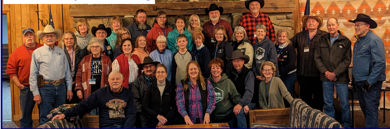
Western Pennsylvania Gathering

with portable generators and heaters. We spent the night in comfort and warmth!